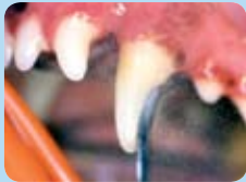
Removing the calculus using an ultrasonic scaler, followed by polishing the teeth is a very effective form of treatment

A healthy mouth typically has bright white teeth and shrimp pink (or sometimes pigmented) gums. However plaque bacteria are constantly accumulating on the surface of their teeth and will, in time, lead to inflammation of the gums – a condition called gingivitis . Affected gums are more reddened in appearance, and these changes may also be associated with localised mineralisation of the plaque to form calculus (tartar) – see picture (b).