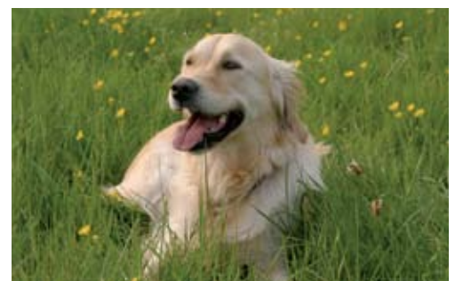
Puppy photo: Jane Burton

All our surgeries are open from 9-00 until 18-00 Monday to Friday and on Saturday till noon in case of emergency outside these hours please contact Vetsnow on (0115) 9789143