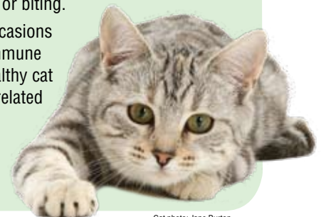
Cat photo: Jane Burton

The good news is that there is a very effective vaccine, giving cats protection against this deadly disease. Please contact us for further information or an appointment.