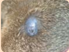
Skin lump on the elbow of a cat

If you do find a lump it is therefore very important we examine it as soon as possible – in order that we may establish the underlying cause and start any required treatment without delay. If you are concerned about a lump on your pet – or any other health problem, don't delay – please contact us today for an appointment!